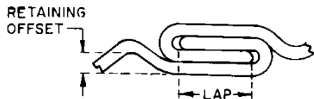
CROSS - SECTION of LOCK SEAM