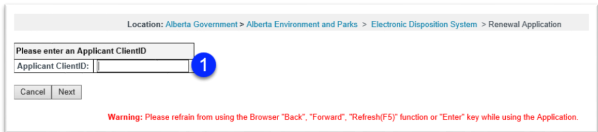
Figure 2 – Renewal Application: Applicant Client ID screen

Once EDS displays the “Renewal Application: Applicant Client ID” screen, proceed per steps below.